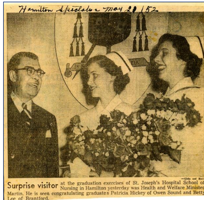
Paul Martin Health Minister

The government is also carrying on a program to try to encourage nurses to stay in the country and urge a limit on nurses entering outside employment. He explained that many nurses are now employed by airlines and other businesses.