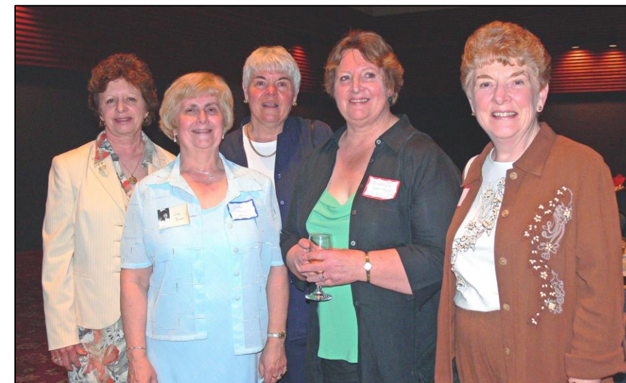
Reunion day 2007

1965 - 1966 served on the Nurses Alumnae Executive as 2 nd Vice President and as Program Convenor